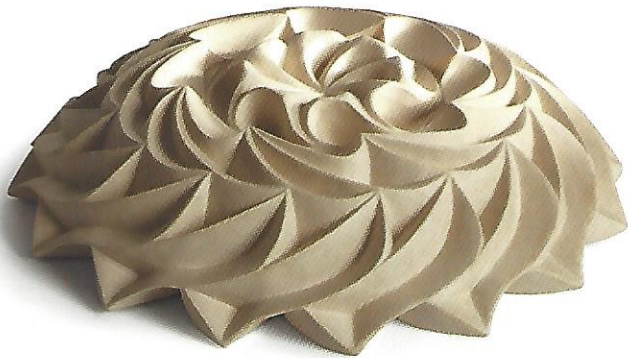
REM 2006 | 유약이 없는 점토 REM 2006 | unglazed clay | D. 30.5cm